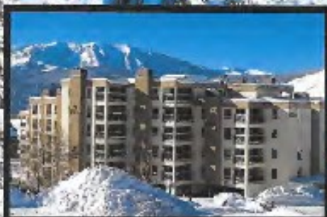
The Plaza Condominiums