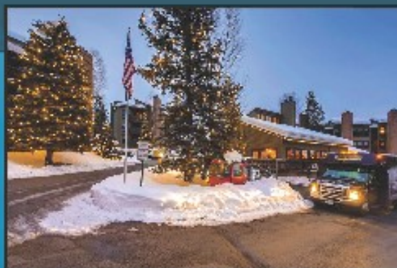
The Lodge at Steamboat