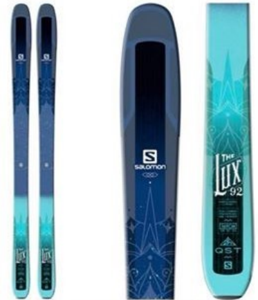
Salomon QST Lux 92 Womens Skis 2018

Men's 2017 Rossignol Experience 84 HD, 170cm All-Mountain skis with Look SPX 12 Dual Konect bindings