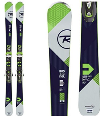
Men's 2017 Rossignol Experience 84 HD skis with Look SPX 12 Dual Konect bindings

Women's K2 Burnin Luv, 153cm w/Marker bindings